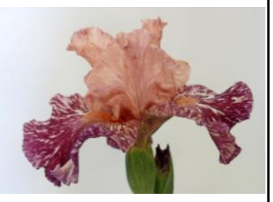
1st Place- Anaconda Love