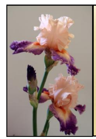
By Popular Demand-1st