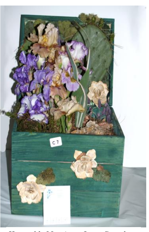
Honorable Mention—Joyce Crenshaw