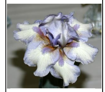
3rd Place-Chubby Cheeks