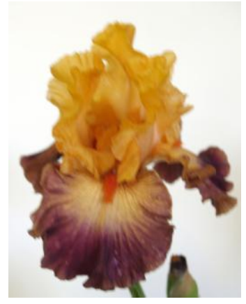
President's Award Strike a Pose