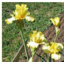
Men Like Me.jpg