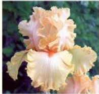
Breath Of Dawn.jpg