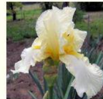
Reseda Moon - .jpg