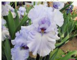
Sea Of Love.jpg