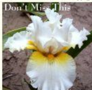
Dont Miss This.jpg