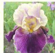
Lets Be Friends.jpg