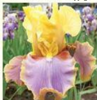
Waimea Canyon Sunrise.jpg