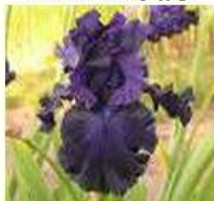
Shadows of Night.jpg