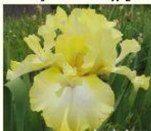
In a Heartbeat.jpg