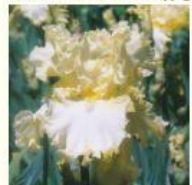
Dancing in Ruffles —.jpg