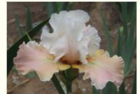
Heaven And Earth.jpg