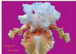
Glory of Dawn.jpg