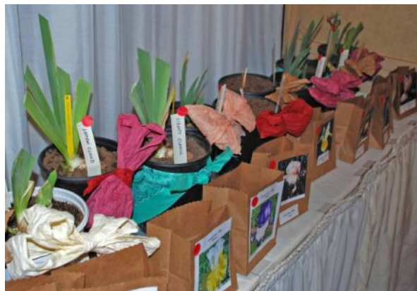
Raffle Items (C Buchheim)