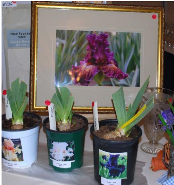
Live Auction Items (C Buchheim)