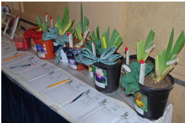
Silent Auction Items (C Buchheim)