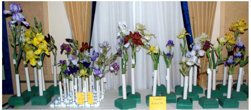
Reblooming Iris Display (C Buchheim)