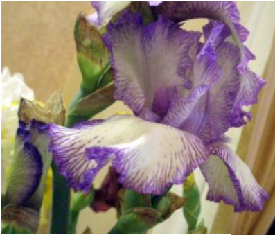
Autumn Circus -above