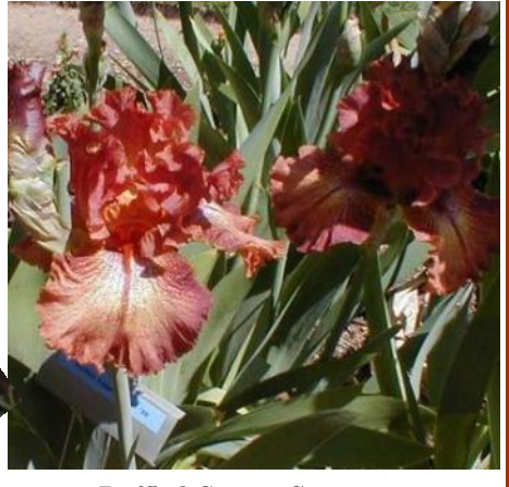
Ruffled Copper Sunset