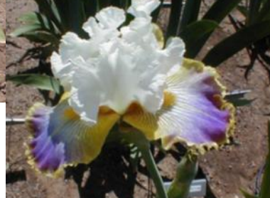
Wild Angel