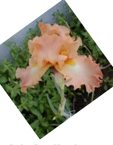
Dodge City