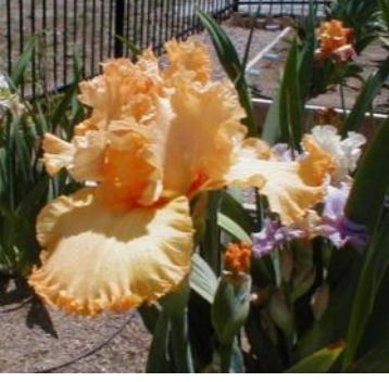
Prime Power