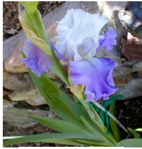
Cruise Control