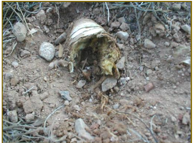
Bacterial soft rot in Mary Frances

Editor's note: In order to get to know one another better, we would like to feature a member's gardening story every month. Don't be bashful, email your story to me. Our members would love to hear about your experiences. You can also mail your article to 2175 Aspen Acres Dr. Prescott, AZ 86303. I am also collecting your helpful hints on growing irises. We don't all use the same techniques and we would like to hear what works for you.