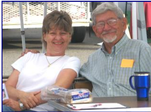
PAIS CEO and CFO looking pleased as punch at Farmer's Market

I am happy to have made new friends among the members of PAIS. It is always nice to share what we all love.... a beautiful iris. I can't wait to see my own new plants "show off" next spring. And, of course, I'll be right there when they ask for volunteers to help out at the next event. I hope to see you there, as well.