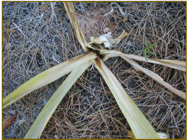
Signs of soft rot, leaves turning yellow and falling over.