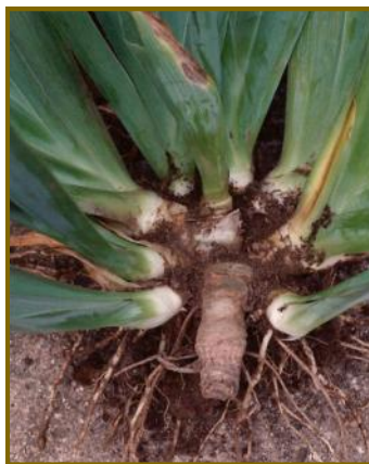
1 years growth on rhizome fertilized with rabbit manure

As the marriage went down hill, I gradually pulled back on my workload. The garden and the chickens were the last to go. Leaving that farm was one of the most difficult things I have ever done. I cried as I walked up and down the aisles of the garden, of the chicken house, the rabbitry, and through the many trees I had planted and bid farewell to "Tiller the Hun."