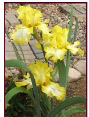
Abby & Me ,Tom Burseen 2003

Here is how it can work: listed below are things I learned this year that may help you grow better iris, so I’ll pass them along. I have tried most of these ideas myself as I increased my iris beds from 200 named variety irises (spring 2009) to 360 irises now. I can’t guarantee these ideas will work for you or even if they sound feasible. I’m just sharing what someone has shared with me. Continued on page 7