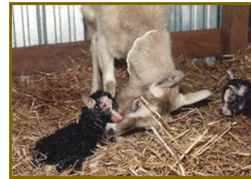
Minutes old Toggenburg goats

While I loved doing all this, I always love doing too much! In addition to the garden I had two flocks of chickens, one fertile flock, the Araucanas, and the Cherry Eggers without roosters. I had a commercial rabbitry with 55 working does and butchered about 25 a week for my market. To keep busier I got into Toggenburg dairy goats and made wonderful yogurt. Then I decided I needed some sheep since I love lamb. . . so I bought three bred Katahdin hair sheep ewes.