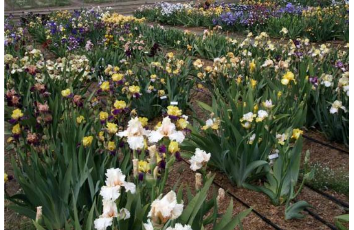
Landscape – Ray Waugespack