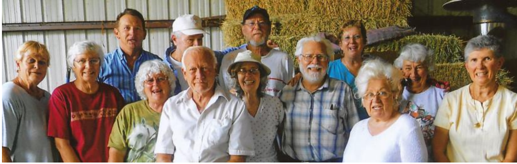
Most of the Motley Crew, still trying to smile, after marking irises at the Floyd ranch in the Verde Valley