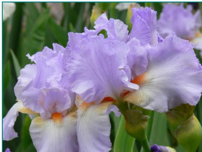
Rippling Waters, Fay '61 Dykes Medal 1966