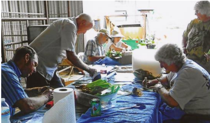
Patiently marking the irises