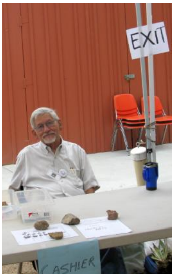
Claude looking for customers