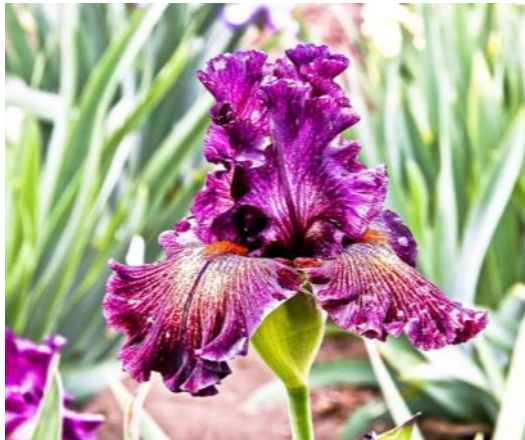
Individual Iris –Ray Waugespack

Section A – Landscape - 1 st – Ray – 2 nd Vera Section B – Individual iris – Tie – Ray and Roxanne Section C – Artistic – 1 st –Judy – 2 nd –Roxanne Section D – Something else 1 st –Vera, 2 nd Candy