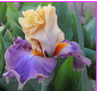
Calabash Sutton 08

the Spring Trek. After the Spring Trek they are dug up and distributed to the various clubs in our region to be auctioned off with the proceeds going to support Region 15. It's a great way for you to get rhizomes from 'Hybridizer's Special Picked Irises' at a discounted price of whatever the silent bid will bring.