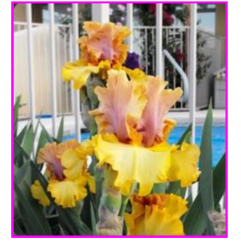
Nouveau Riche Keppel '08

This event is all about having good treats and good times.