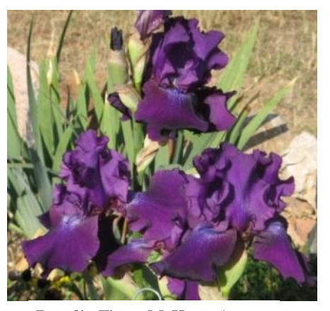
Rosalie Figge McKnew '93