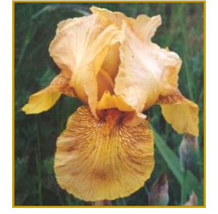
Real Gold '52

introduced the first space age iris, Unicorn . He describes the iris in his catalog: "This horned iris represents the greatest breakthrough of an entirely new, highly decorative iris form that has occurred in the last half century. Customary beards, instead of reposing quietly on falls in normal position, are raised, separated from falls, projecting as striking plumed horns"