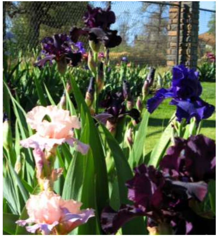
Celebration Song, Superstition, Dusky Challenger, Midnight Oil