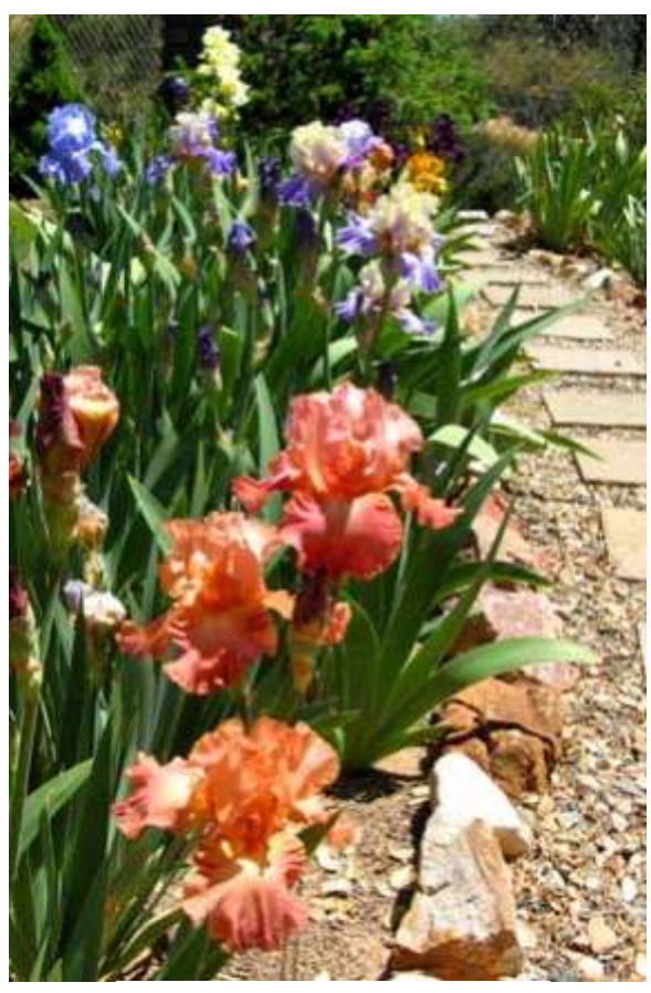
Role Model, In Your Dreams