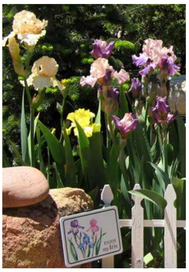
Angel Blush'-left 'Copy Right-yellow, & 'Soto-on right