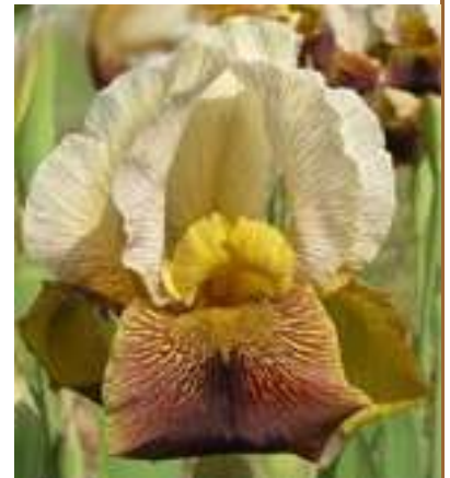
Rare Breed, Tasco '11