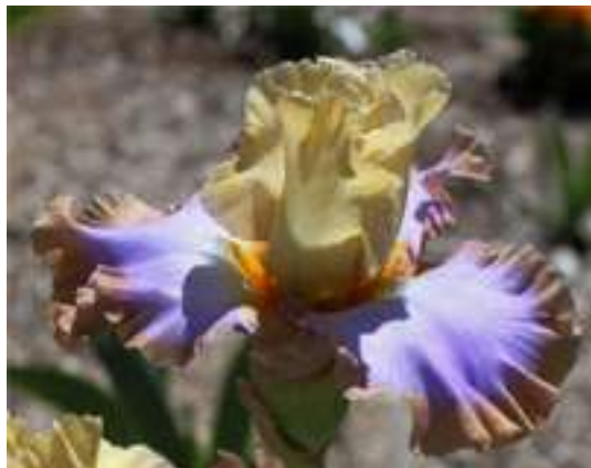
Bandwidth, Sutton '10