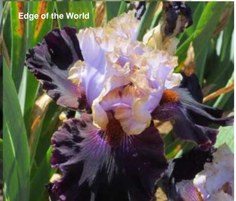
Edge of the World