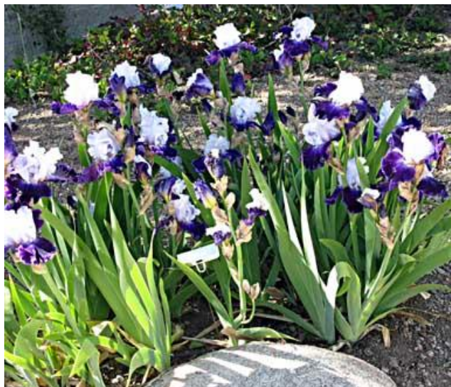
Royal Storm on east side of Performance Hall