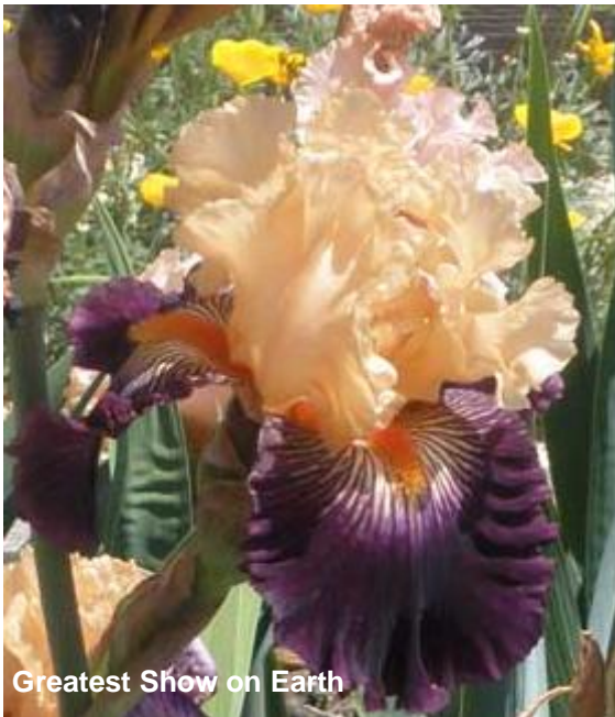
Greatest Show on Earth