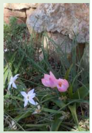
Tulips and ????? Stan Book