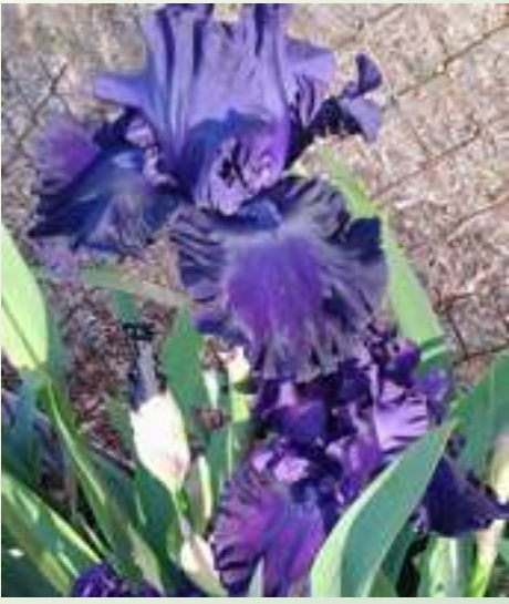
Shadows of Night Tasco 2006 Dan Schroeder