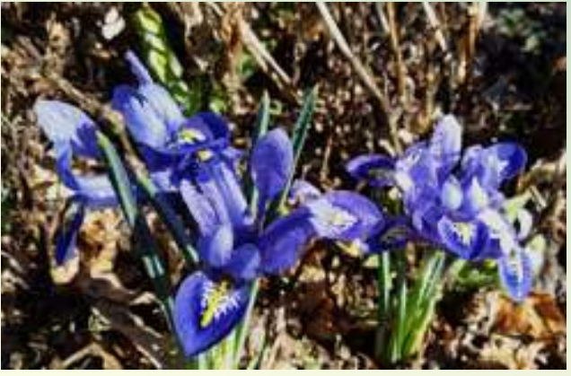
Iris reticulata - Dede

DEDE ERCEG, our sculpture garden coordinator, was recently featured in the <u>Chino Valley Review</u>, Iris are garden's bread and butter, CV woman says. Check it out: http://cvrnews.com/main.asp?Search=1&ArticleID=60178&SectionID=74&SubSectionID=114&S=1