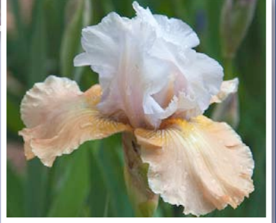
Reblooming Iris in PAIS Members' Gardens (shown top to bottom): IB Eleanor Roosevelt, TBs Champagne Elegance, Returning Rose, Rosalie Figge (center), Total Recall