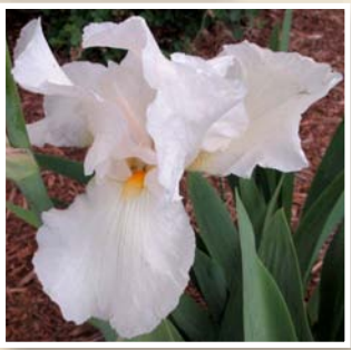
PAIS Members' Most Dependable Reblooming Iris Blatant (top), Double Your Fun (center), Elainelope, English Charm, Immortality (above), Mother Earth, Returning Rose, Total Recall, Wearing Rubies