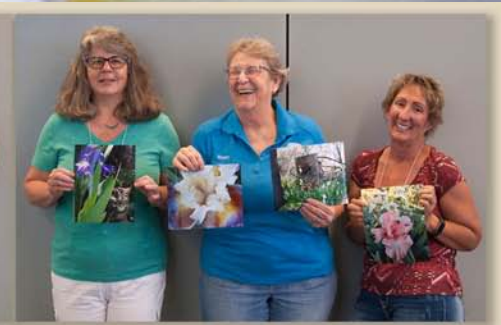
PAIS Annual Photo Contest Winners