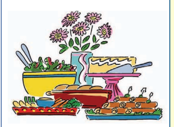
Don't Forget! It's a Potluck...

Deb Wade - New Sept 2019 deb7909@gmail.com