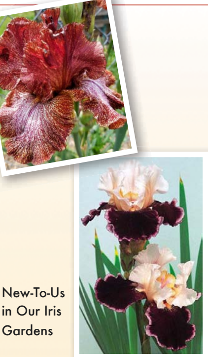
in Our Iris Gardens

Kellie's Garden: TBs 'American Original'.'Crimson Snow'.'Redneck Girl'