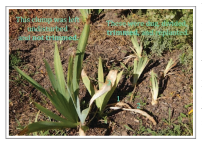
The foliage on this clump on the left should not be trimmed. If you want to tidy up, remove just the dead leaves (1) and (2) and the dry end of leaf (3).

looks pretty tired and unattractive. Many leaves are drying at the tips, getting a little pale and floppy, and perhaps suffering from damage from insects or other ailments. Ironically, if you trim the leaves back, then the tops where you cut them will just turn brown and dry up, so instead of tall leaves with dry ends, you have short leaves with dry ends. Was it really worth it?