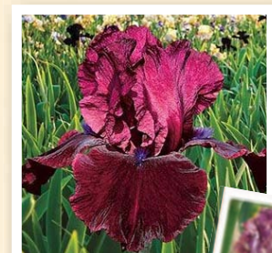
Marty's Garden: TBs 'Bewilderbeast'. 'Marshmallow'. 'Mesmerizer'

Kellie's Garden: TBs 'American Original'.'Crimson Snow'.'Redneck Girl'