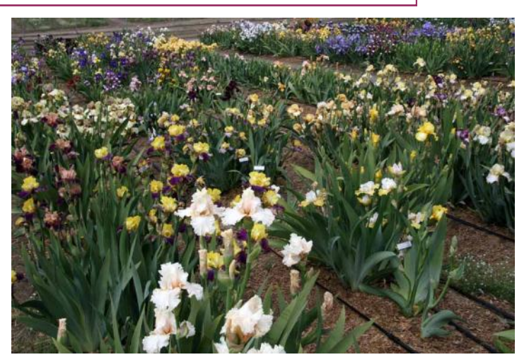
Landscape - Ray Waugespack