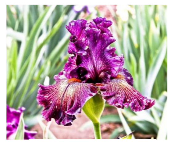
Individual Iris -Ray Waugespack

Section A – Landscape - 1<sup>st</sup> – Ray – 2<sup>nd</sup> Vera Section B – Individual iris – Tie – Ray and Roxanne Section C – Artistic – 1<sup>st</sup> –Judy – 2<sup>nd</sup> –Roxanne Section D – Something else 1<sup>st</sup> –Vera, 2<sup>nd</sup> Candy