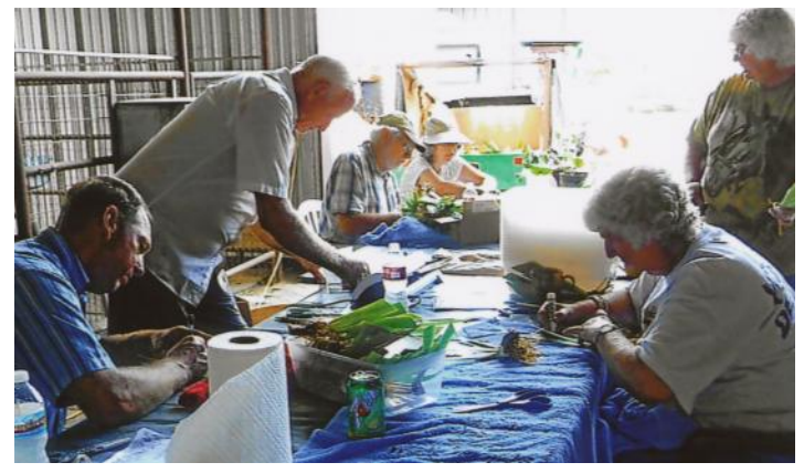
Patiently marking the irises