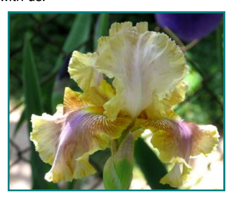
Oh So Pretty Cookie's garden