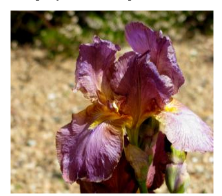
Cranberry Tea-YC Garden

Alta Vista Garden Tour June 12 Celebrate National Garden Week by attending the Prescott Garden Tour on Saturday, June 12, 2010. For your pleasure and inspiration this self -guided tour features six private, distinctive gardens open from 8 AM until 4 PM. Limited numbers of tickets for a $10 donation are available by contacting Cathy at 928-541-9341 or caasam@cableone.net.