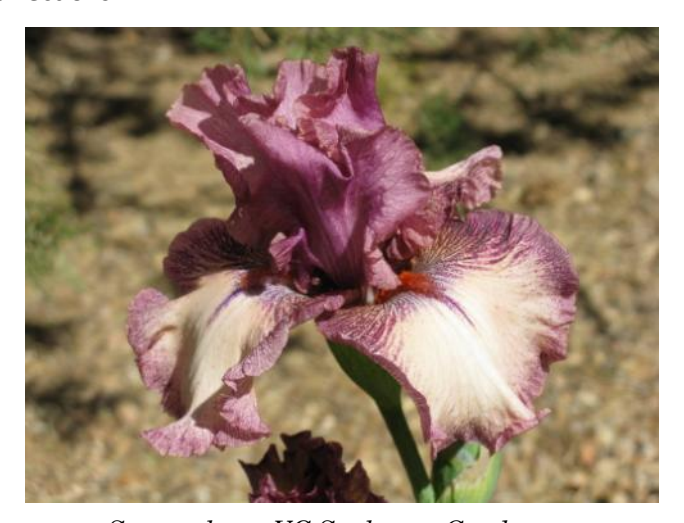
Screenplay - YC Sculpture Garden

We are doing things a little differently this year, instead of a tour where everyone follows each other we are just giving you the addresses and times and letting you decide in what order you want to see the various member gardens that are open for viewing. This method worked very well for the Verde Valley and Sedona tour and it means there will be less people arriving at any location at the same time. This makes it easier for photo opportunities and viewing of the irises. See page 6 for addresses and directions.