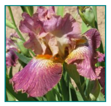
Too, Too, Ripe Nancy's garden