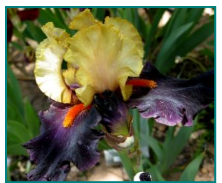
Secret Service-Annette's garden