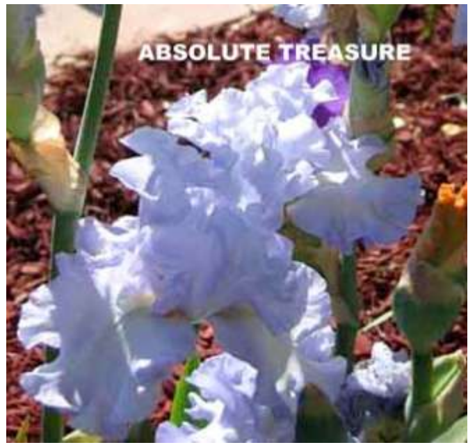
2013 AIS Medal Winners