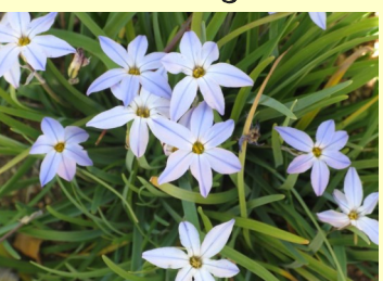
Star Flower

This is a Flowering Pear tree in my neighborhood that I drive past everyday. Also love its spectacular fall foliage. Last fall I planted one in my yard but of course mine looks nothing like this "YET".