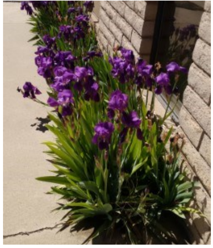
Crimson King

The following PAIS Facebook group discussion about Crimson King was from April 2017: