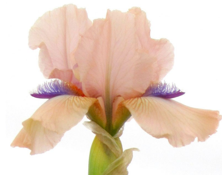
Concertina, Sutton, 2000 IB