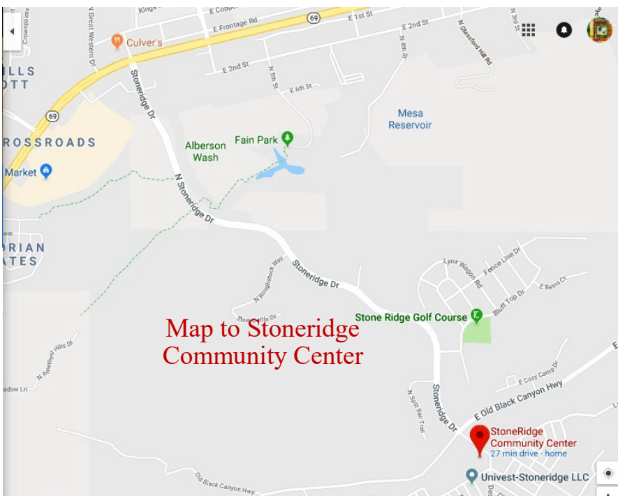
Map to Stoneridge Community Center

2018 P.A.I.S. General Meeting Please Join Us for our