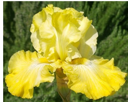
Again and Again, Sterling, 1999