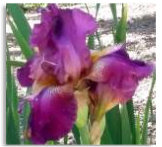
Devil's Spoon Shepard