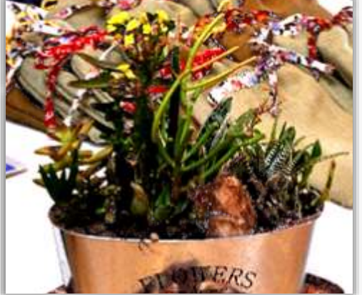
Table centerpiece By Dennis Luebkin